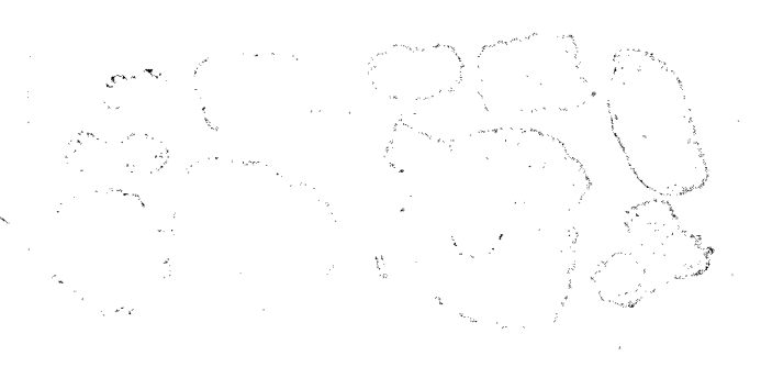
Figure 2. The underside of some rubber molds.

A small amount of liquid latex is brushed onto the glass, and the prototypes are placed on this rubber so that a thin coat (roughly 0.3 mm) will be beneath each prototype. This step is essential in order to obtain molds with well-formed faces. After all of the protypes have been placed on the sheet, liquid latex is brushed onto each to produce a coating roughly 0.5 mm thick. An even coating free from bubbles is desirable. For convenience in handling and storage it is suggested that several molds be connected together to form a sheet (Fig. 2). Such a sheet helps keep molds level while they are being filled with plastic. The cured molds may be identified by writing the relevant chemical symbols directly on the rubber with a ball point pen. Ordinarily about 24 hours should pass before applying a second coat. The number of coats required will depend chieffy on the model size. The larger the prototypes, the thicker must be the mold in order to insure its rigidity when filled with plastic. For example, models of 1 em radius require only two coats, while those of 2 cm radius require four. When the rubber is well cured, the sheet of molds can be slowly pulled away from the glass.